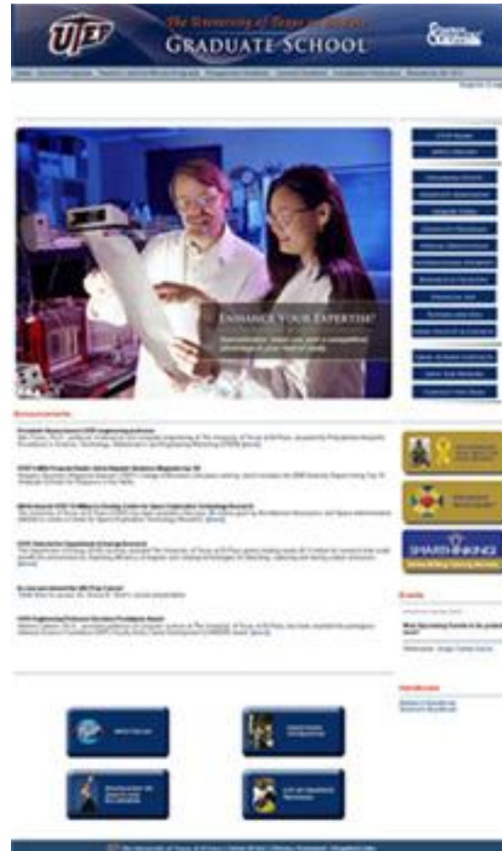
Graduate School http://academics.utep.edu/graduate

If you are an administrator of a Pete's Pagebuilder web site and you would like to create your own skin, please visit: http://dnn.utep.edu/Default.aspx?tabid=54092 for online tutorials and information.