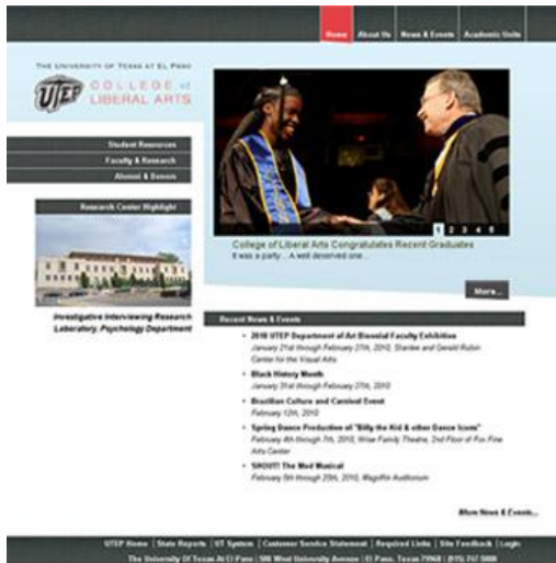
College of Liberal Arts http://academics.utep.edu/libarts

Displayed below are a few examples of custom skins that can be created using Pete's Pagebuilder: